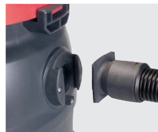
Robust plug-in suction hose