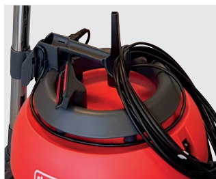
Handle with practical cable holder and cable strain relief