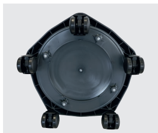
5 castors for stability and agility